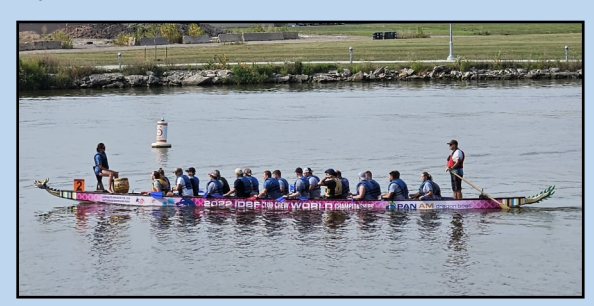
Ready to Race