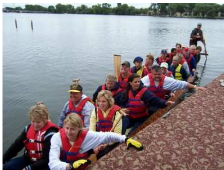
The Dragon Crew