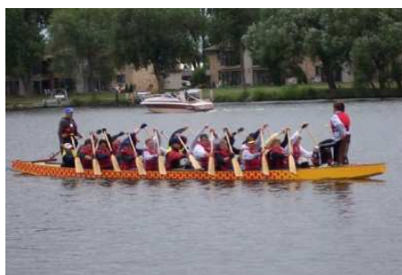
"At - ten - tion!"