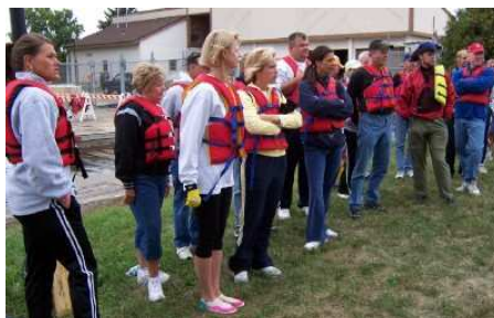
Where are those promised rowing handouts?