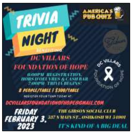
For more information, contact Patti Langkau