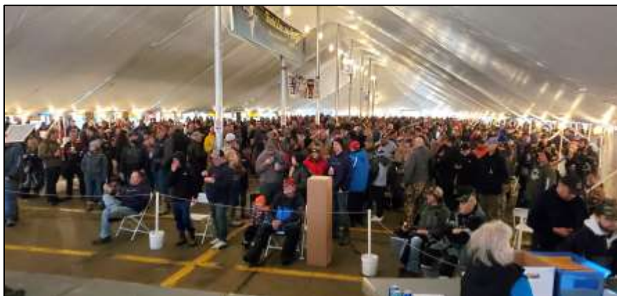
Saturday afternoon, 4pm