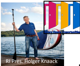
RI Pres. Holger Knaack

The new Rotary theme for 2020-2021: Rotary Opens Opportunities.