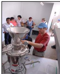
Soy Cow LaMolina Peru

Every Rotary club is urged to undertake a new World Community Service project each year. The WCS Projects Exchange list is an excellent tool to find a real need, a project description and cooperating club in a developing area. The job then is to "go to work" to complete the project, and at the same time build bridges of friendship and world understanding.