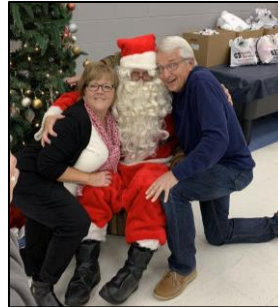
Parent Connection Christmas Party