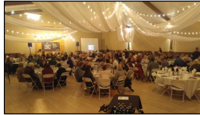
The Perfect Pair