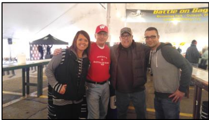
Battle on Bago