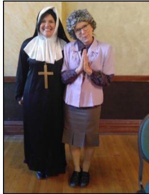
Changing of the Guard