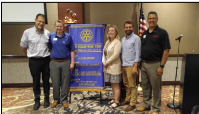
New Member Induction