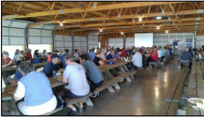
Flying Rotarians Picnic