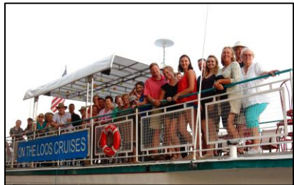
On the Loos