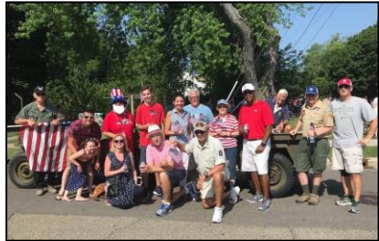
4 th of July Parade