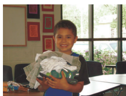
Happy faces say, "Thank You!"