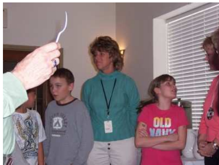
"It's a fork...It's a fork...It's a fork...Ahh!" A Tribes Community Activity