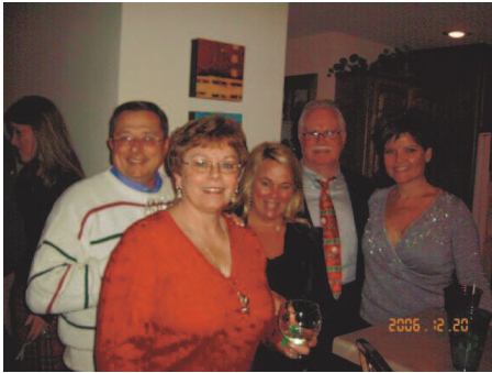
Rotary Christmas Party 2006

(More photos on the Club Web site - see "What's New" on the home page)