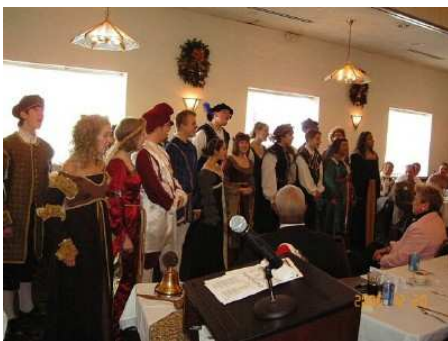
The Oshkosh West High School Madrigals December 20 Rotary Meeting