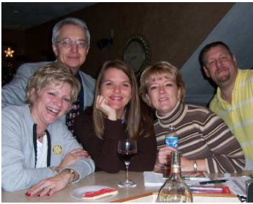
Happy Elves – Wrapping Party 2006