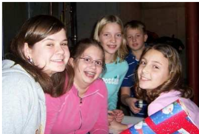
Jr. Rotary Elves “I’m coming back next year this is so fun!”