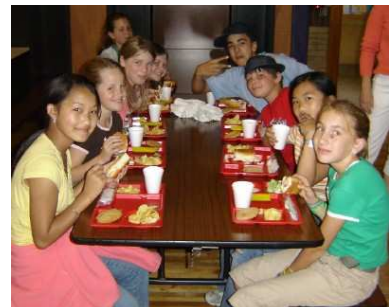
The Canned Food Drive helps our Roosevelt School PALS maintain stocked shelves at local food pantries