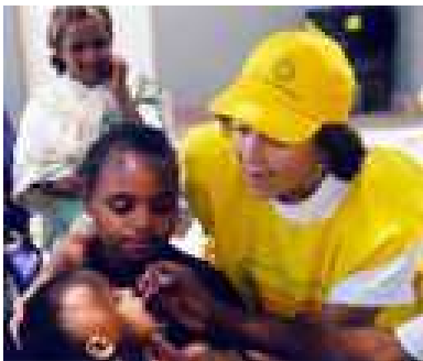
A Rotarian administers polio vaccine drops to an Ethiopian child.

November is Rotary Foundation Month. So much of what Rotary is known for – international service projects, grants, scholarships and above all, Polio Plus – depends on the Foundation. Rotarians every year give to the Foundation. We know that our money will be used wisely and that together we can do so much more than we could ever do alone.