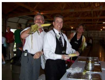
Chitwood's definition of ear of corn! EAA Picnic 2006

Please send information to be included in next week's copy of THE HUB by Friday to: JoAnn Konkel at konkel@uwosh.edu