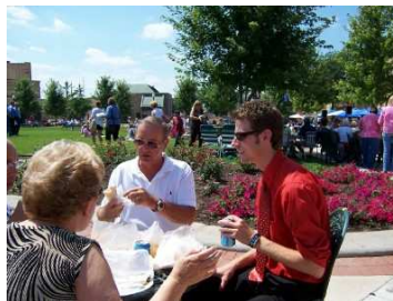
Live at Lunch 2006