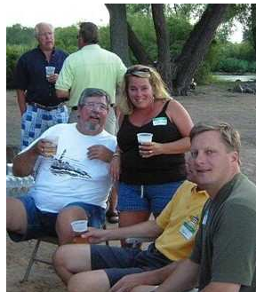
Fowler Fun Night 2006