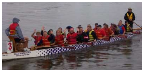
Heading out to the starting line