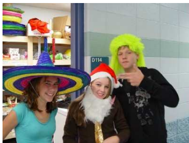
Hamming it Up