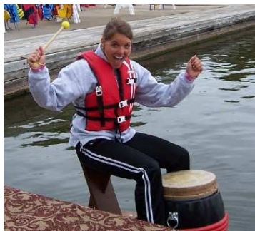
And the beat goes on!

Raindrops... team cheers...wet clothes...paddle splash...stroking chants...drum beats...hanging out...laughter...munchies... a bee sting... pep rally Vander Loop style ...stroke, stroke... "let 'er run!"...three heats... 10, 9, 8, 7...quarter-mile... paddle, Paddle, PADDLE!