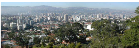
El Marques, going up to La Julia in El Avila National Park

Places that I would suggest that Southwest Rotarians see near my hometown: You have to go to El Avila National Park. In this park is a beautiful stroll. There are also beautiful beaches in La Guaira that you could go to. The Children's Museum is also nice for adults, too.