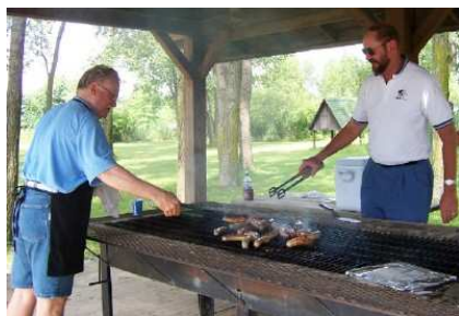
Our expert grillers!