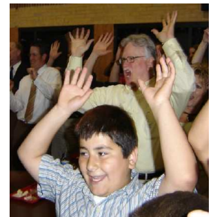
Hanging out with our PALS at Roosevelt School 2006