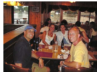
Enjoying the Rotary Boat Trip