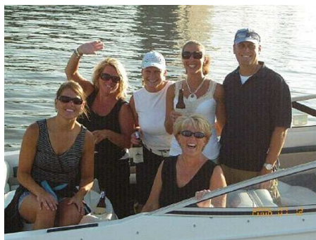
Everyone's Happy! Rotary Boat Trip in July

September 27 – District 6270 Governor Mike Slawny will be our guest.