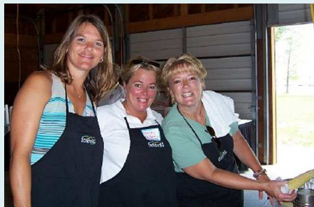
The "Three Huskateers" prepare buttered corn on the cob